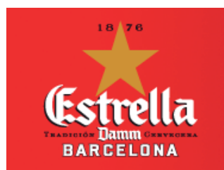
THE FIRST ESTRELLA